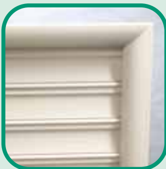
Belled shutter has a curved, aerodynamic frame.