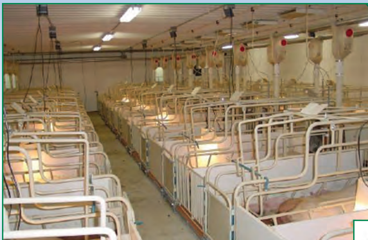
Hog Farrowing Barn

Save money on your energy bill with CBM Electronic Lighting. The completely waterproof energy saving electronic ballast is standard. The instant start allows even more energy savings. The electronic ballasts are listed as 120/277 volt self-adjusting in case of power surges. The fixtures are made from quality rust resistant material and the high quality bulbs last 20,000-30,000 hours.