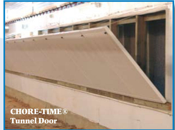
CHORE-TIME® Tunnel Door