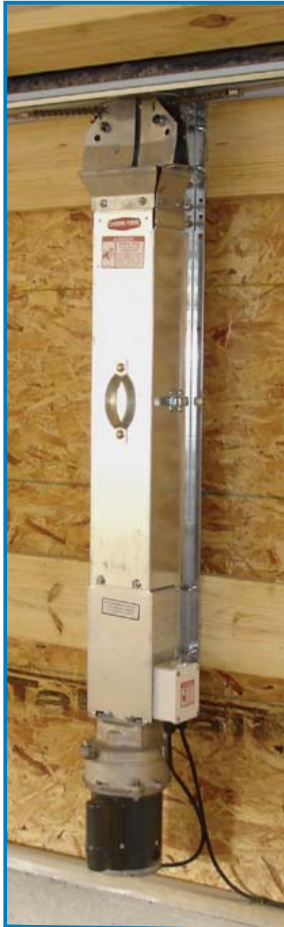
Available models include: chain with swivel sprockets (shown), cable with swivel pulleys, or cable straight-out (from the top of the winch body).