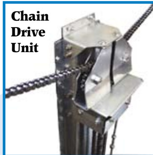
Chain Drive Unit